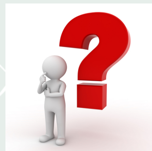
Student Choice Approved by Teacher