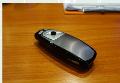
PowerPoint or Keynote Presentation